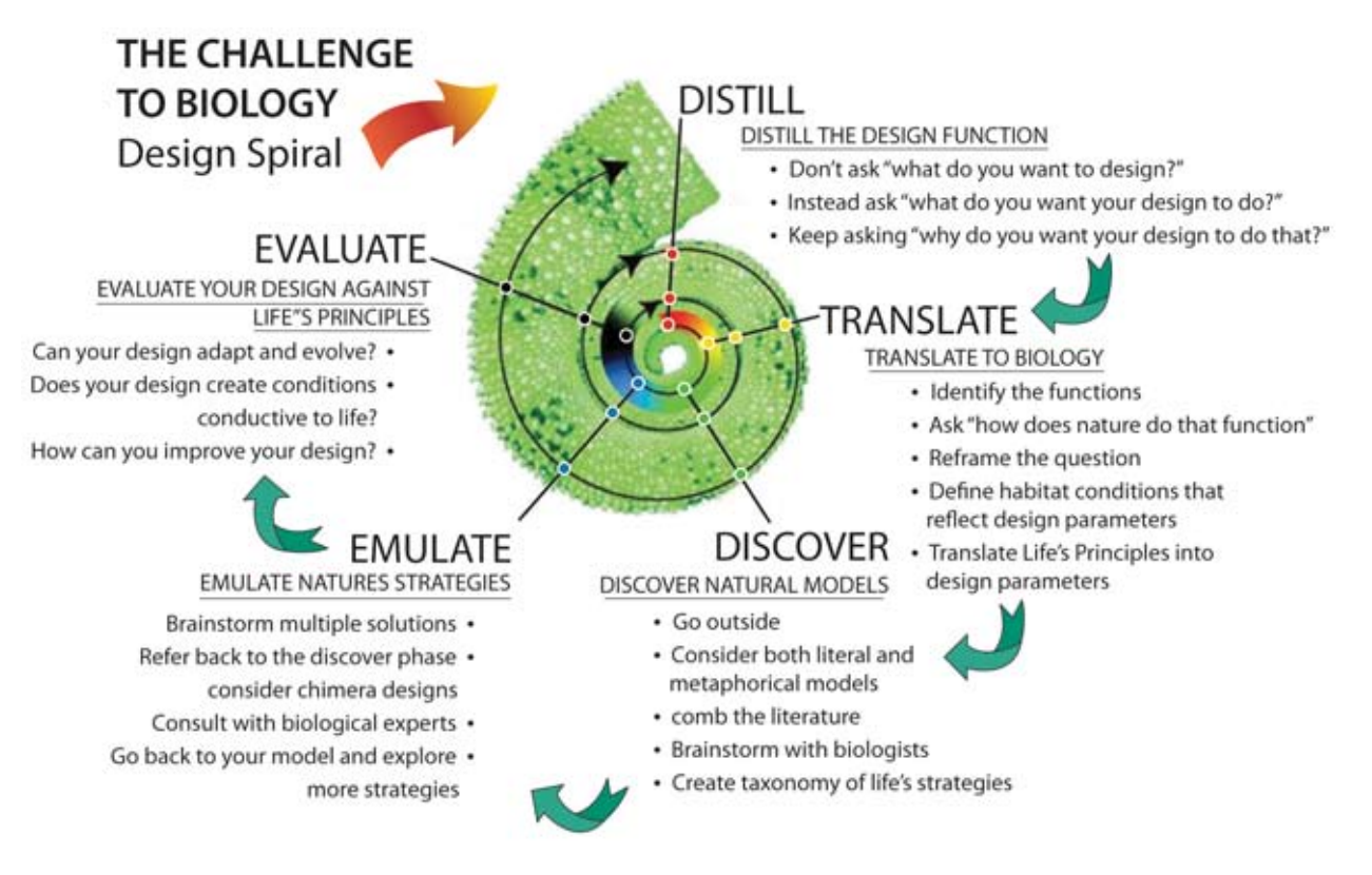
Figure 3: Design Spiral Methodology (used with Permission).

and on its head, the true spirit of transdisciplinarity. Scour the literature and brainstorm solutions.